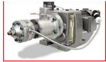
Oil Press purchased for KAMI