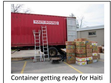
Container getting ready for Haiti