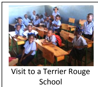
Visit to a Terrier Rouge School