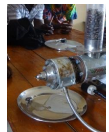
Oil being produced by the

We were excited to see a demonstration of the oil press on the day we met with the members of "Les Entreprises KAMI," made up of all the individuals and groups who work with KAMI. The Bawochen Co-op had brought a big bag of Jatropha seeds which they had gotten together to shell. The hopper was filled up, the generator fired up, the oil press turned on, and the oil came gushing out – briefly. The press had plugged up! Everything was taken apart, the press was unplugged, and we were ready to go again. The machine was turned on, the oil gushed out and it plugged up again.