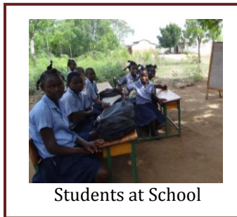
Students at School

We also visited a school in Phaeton, a village close to the